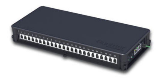
GAT NET.Controller S 7020