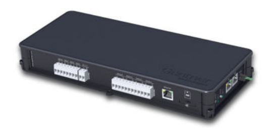
GAT NET.Controller M 7020

Each master controller can control up to 8 sub controllers and 192 locks over a maximum cable length of 800 m. To reduce costs and complexity for smaller MIFARE®/ISO systems, a Light version of the sub and master controllers is available.